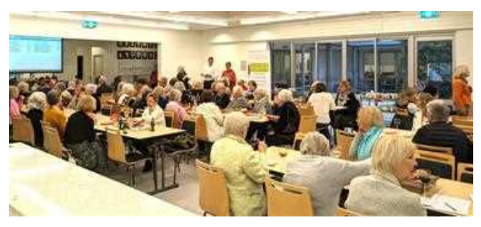
Super Saturday – Post Bridge Fun and Games in the Social Area.

<u>Super Saturday</u>: A good turnout including a supervised section. Happy bridge; red points; a thought-provoking bidding quiz (yes, sometimes Pass is your best option); food; bingo; prizes and course the Matilda's nail-biting, perfectly timed shootout; all combined for a very enjoyable day. Don't miss the next Super Saturday in November.